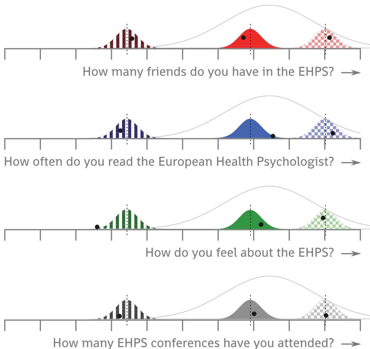
Figure 1: the scores of three individuals on four items that satisfy the assumptions of the 'parallel model of reliability'

the independent samples t-test and the paired samples t-test change the way the value of Student's t needs to be calculated, the assumptions of the different reliability models determine how a test's reliability can be estimated. A shared assumption of both of these models is that the items measure one underlying construct ('unidimensionality'), in this case