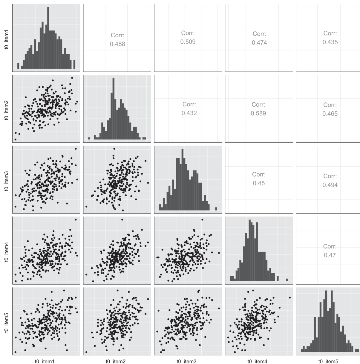
Figure 3: A scattermatrix as produced by the scaleDiagnosis() function in the userfriendlyscience package for R

no clue as to how much higher). We know nothing about the internal consistency of the scale. For those studies that published the questionnaires as appendices or supplemental materials, it is possible to inspect the items to establish the face validity (i.e. whether the items seem to tap cognitions/emotions that make up or contribute to the construct the scale