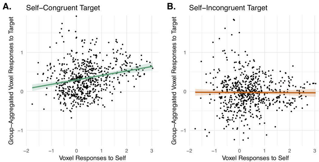
Fig. 2. Illustrative scatter plots from an individual participant depicting the difference between self-congruent targets (A) and self-incongruent targets (B) here represented as simple pattern correlations. Individual points represent voxels within the localized region of interest in the medial prefrontal cortex, with self-referential responses on the x-axis and group-averaged target responses on the y-axis. Self-referential brain activity in the target is more strongly associated with the brain activity of friends when they are thinking about the target (i.e. self-congruent) than it is when friends are thinking of a different target (i.e. self-incongruent).

of multivariate fMRI analyses where there is a need to preserve finer-scale neural responses). A multi-step normalization procedure was used to register results to standard space. First, functional data were corrected for spatial distortions using a field map unwarping before aligning functional data to each participant's anatomical scan using boundary based registration (Greve & Fischl, 2009) in conjunction with a linear registration with FSL's FLIRT tool. These images were then warped to a 2mm MNI template using nonlinear registration with FSL's FNIRT tool and a 10mm warp field. All first level task-based analyses were performed in participant's native space before being warped into standard space for final analyses. Parameter estimates were separately estimated for the self condition as well as for each of the ten other peers within each of the six runs. These responses were then combined in a second level within-subject fixed-effects analysis yielding a parameter estimates for the self as well as parameter estimates for each of the other ten participant's conditions. Normalized (i.e., z-score) voxel responses for each condition within the MPFC ROI defined in the functional localizer task served as input to the subsequent round-robin analysis.