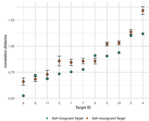
Fig. 3. Within-target dissimilarity (i.e. correlation distance) of perceivers’ neural patterns to target’s patterns during self-referential thought. Green dots show the dissimilarity between targets thinking about themselves with perceivers thinking about the target (i.e. when the self was congruent with whom the perceivers were thinking). Orange dots show the dissimilarity between targets thinking about themselves with perceivers thinking about different targets (i.e. the self was incongruent with whom the perceivers were thinking), with error bars indicating a one standard error across incongruent targets. As tested in the frequentist and Bayesian linear mixed-effects models, self-congruent patterns showed lower values indicating a greater similarity of self-referential thought to the patterns of perceiver’s thoughts when thinking of the congruent target.

Round-robin multivoxel self/other similarity in the vMPFC. Using a commonly used self/other trait localizer task, we first identified the region of the vMPFC that was active during self-referential thought. Following permutation tests and cluster correction, the results from the group-level analysis of this localizer task identified a single cluster of 641-voxels