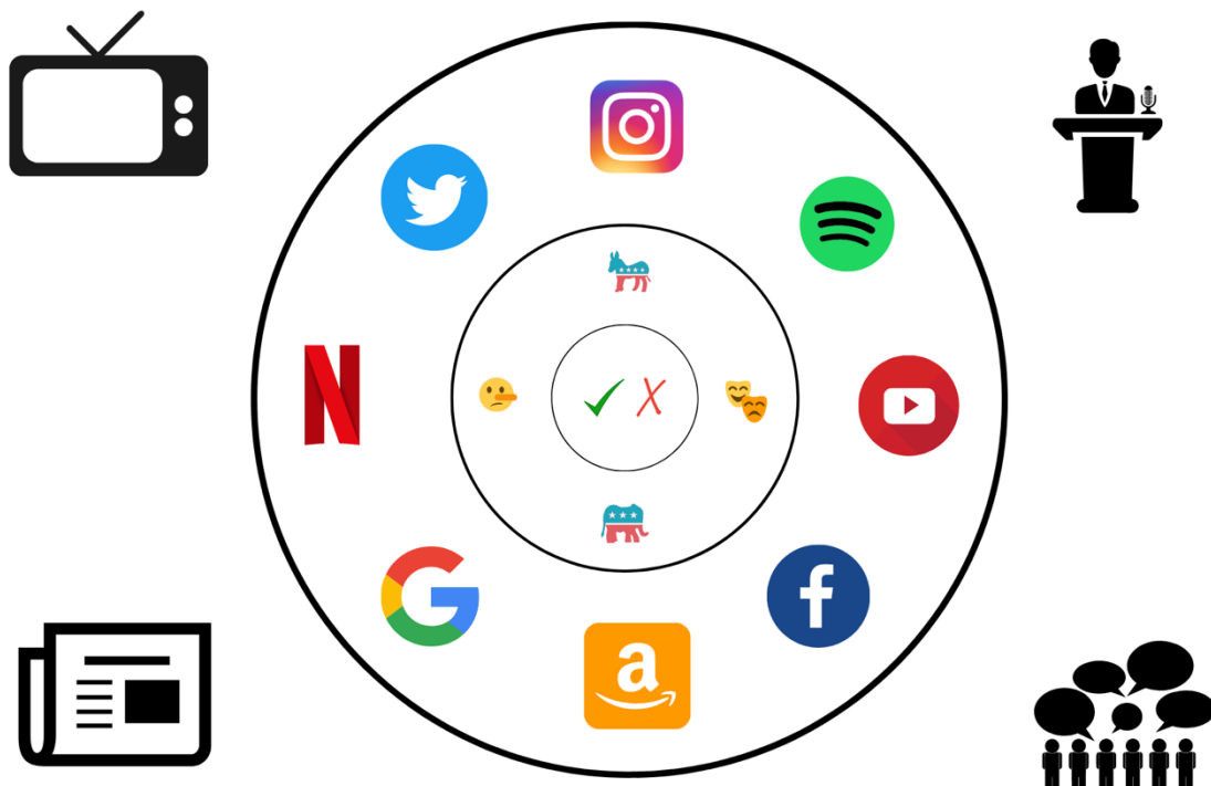
Figure 1. Contextualizing Misinformation Prevalence and Circulation