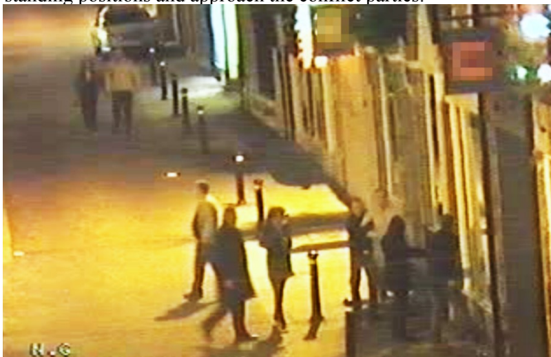
Figure 1c. The two bystanders are joined by others. A male bystander in a dark shirt and jeans pulls the main aggressor from his target, while a female bystander steps between the conflict parties and extends both arms out in a blocking motion.