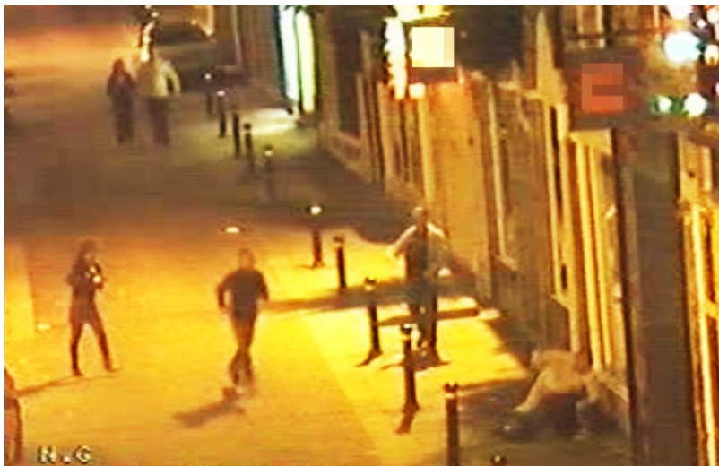
Figure 1b. To the bottom left-hand side, two bystanders leave their standing positions and approach the conflict parties.