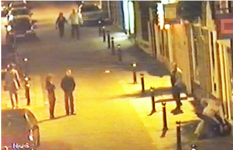
Figure 1a. On the bottom right-hand side, a man dressed in a white shirt assaults another man who is on the ground. Some bystanders observe.