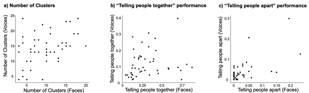
Figure 2 Scatterplots plotting measures from the voice sorting task against the face sorting task.

To investigate whether there was relationship between participants' performance across stimulus modality on the identity sorting tasks, we ran a number of correlation analyses. Shapiro-Wilk tests indicated that data were normally distributed for the total number of clusters for the sorting tasks, but not for other dependent variables. For consistency, we therefore use Kendall's \tau correlations throughout these confirmatory analyses in these sections. These were implemented in the R environment using the Kendall package (McLeod, 2011). We note that results remained the same when we analysed the normally distributed data with parametric tests.